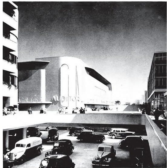
Futurama exhibit, 1939 New York World Fair

Unmanned vehicles can be defined as vehicles which are controlled remotely by an operator, or autonomously operated. Autonomous vehicles are vehicles which are capable of driving themselves. In order to do this, the vehicle must be able to perceive its environment, make decisions about where is safe and desirable to move, and do so. It can also be possible for a vehicle to be only partially autonomous, so that some decisions are made by a human driver, and some by the machine itself.