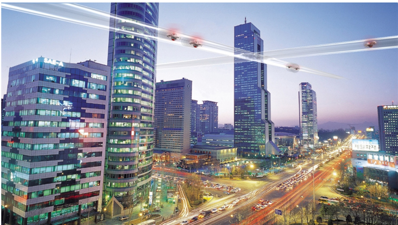
Airspace highways.

There have been some suggestions for the systematic adoption of UAS for deliveries. AirHighway is a US group of UAS engineers and entrepreneurs which is proposing the creation of aerial 'highways' – dedicated airspace corridors – for use by fully automated UAS. They propose that these would navigate by sensors, be able to replace their own batteries, and identify and deliver packages using identification tags. 67 While delivery by UAS may one day revolutionise shipping, the need for extremely high safety standards, infrastructure investment, and meticulous integration planning mean that this is unlikely in the near future.