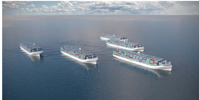
Crewless ship concept.

Autonomous and unmanned technology can be used in marine settings, both in underwater and surface vessels. Scientific research is a main area where these can be used, such as for mapping ocean features like coral reefs. 74 Another area of use is in observation of the sea for commercial reasons, such as in the oil and gas industry. Research to develop autonomous, unmanned cargo ships is in progress. 75 It has been suggested that autonomous submarines could be used to search for illegal drug smuggling submarines, which are increasingly common. 76