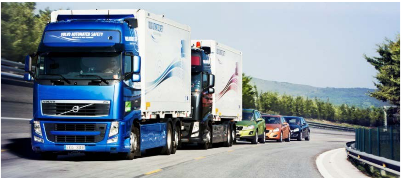
Public highway test of the SARTRE road train.

A fully autonomous car can be defined as a car which is able to perceive its environment, decide what route to take to its destination, and drive it. The development of this could allow significant changes to travel – without the need for human supervision or operation, everyone in the car could be a passenger, or it could even drive with no occupants at all. 12 This could allow productivity and leisure time to be reclaimed from commutes, transport accessibility to be widened for those previously unable to drive, and greater traffic efficiency. 13 Autonomous cars could have a positive environmental impact. Driving at more consistent speeds, with less accelerating and braking, as well as more efficiently chosen routes could result in lower carbon emissions from driving. 14 The efficiency and aerodynamic advantages of road trains are acknowledged in the Appendix .